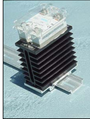
IP00 DIN Relay Removable Touch Safe Cover

Anacon's "Cool One" heat sink designs provide a thermally optimized DIN mounting platform for today's high performance solid state relays. The listings below provide the actual load currents that each part type will support. If you're not sure about how to select the correct product for your application, call Anacon, toll free and discuss your application with us.